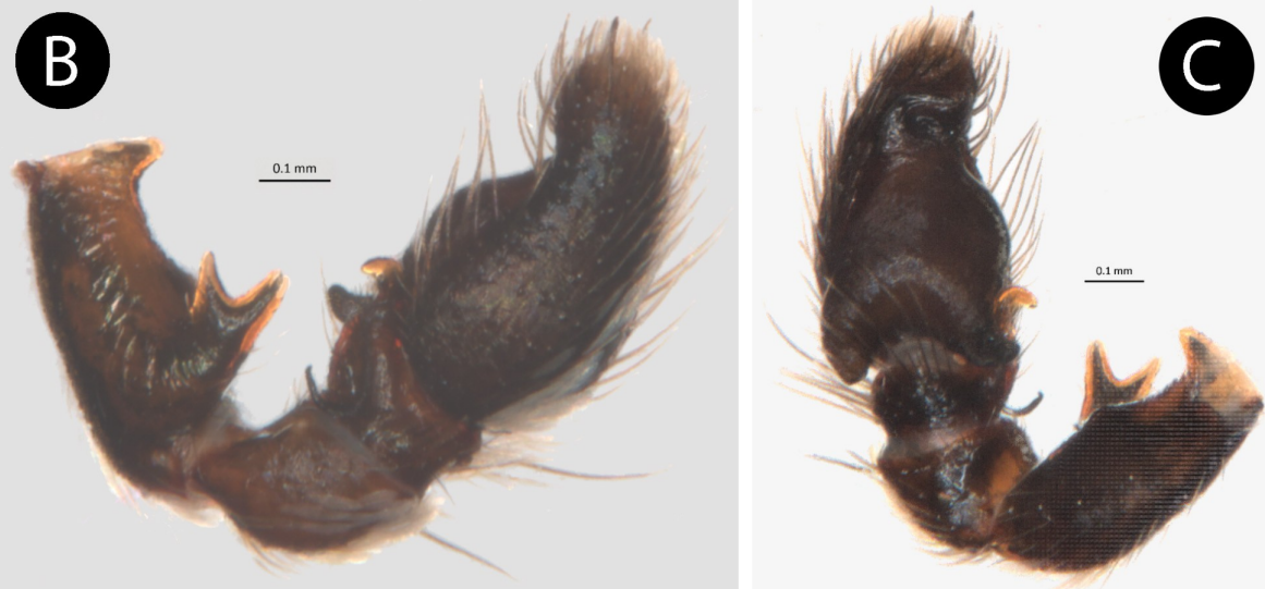
Figure 1. Male Heliophanus kochii . A, Dorsal. B. Palp retrolateral. C. Palp ventral.

Occupants of the residence where the single male of Heliophanus kochii was collected had no history of prior travel outside of the United States. The owner of this residence works in a warehouse that stocks carpeting and other flooring materials, so one possible scenario is that this spider hitchhiked in flooring materials shipped from the native range of this species ( e.g. , Germany is the source of one vinyl floor covering stocked in the warehouse), and the warehouse worker may have inadvertently transported it to his residence. Another adventive salticid that is native to Europe and Asia, Myrmarachne formicaria , has been collected twice in the same warehouse - see label data below.