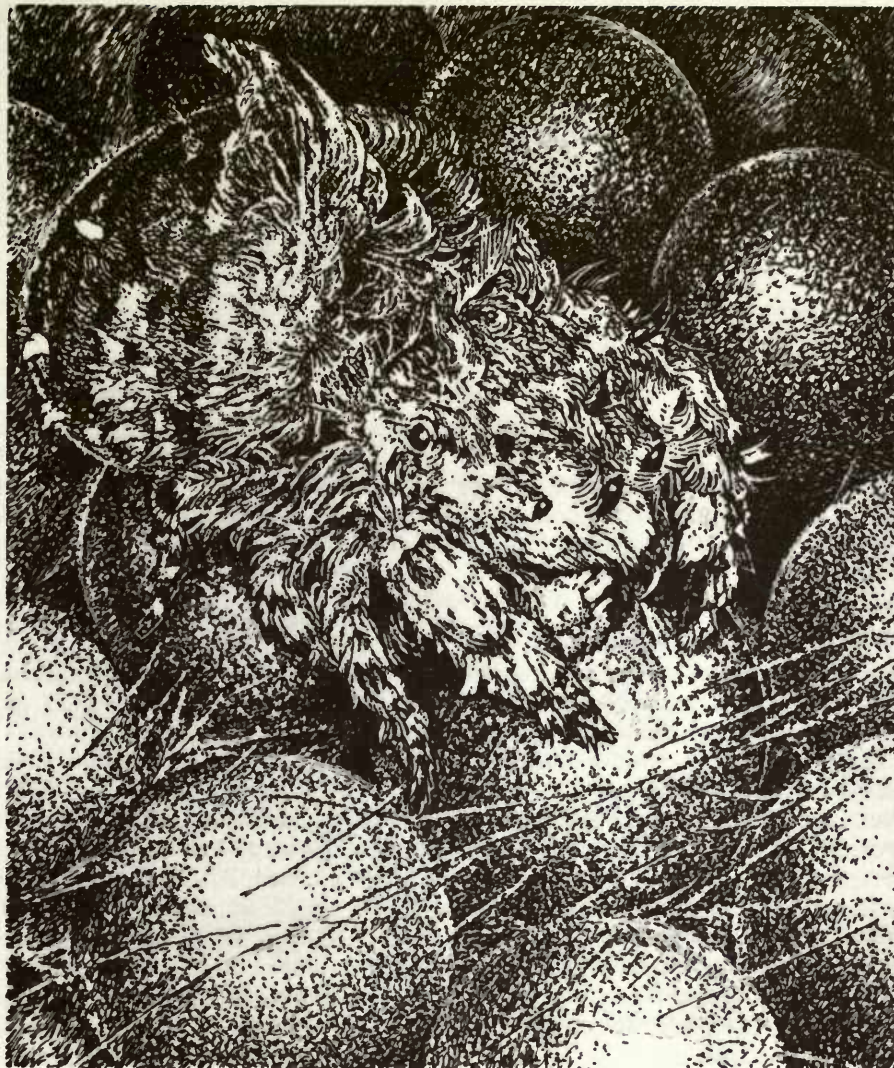
Fig. 2. Phyaces comosus Simon eating an egg of a much larger salticid ( Bavia aericeps Koch). Its fangs are piercing the chorion of the egg. The eggs are almost equal in size to the P. comosus .

When \frac{1}{2} –1 body length away, P. comosus stood inactive for 1–10 s, occasionally longer, then suddenly lunged forward and grasped its prey. There were no evident preliminaries to lunging (legs were not lifted, etc.). Prey was grasped with chelicerae alone. P. comosus was observed to capture a D. melanogaster only twice (vestigial winged in both cases), but all pursued salticids were captured.