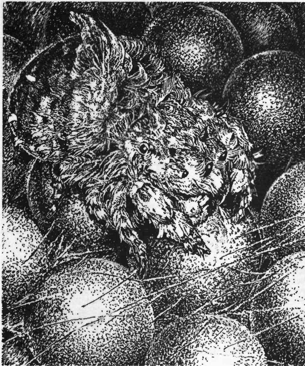
Fig. 2. Phyaces comosus Simon eating an egg of a much larger salticid ( Bavia aericeps Koch). Its fangs are piercing the chorion of the egg. The eggs are almost equal in size to the P. comosus .

When \frac{1}{2} –1 body length away, P. comosus stood inactive for 1–10 s, occasionally longer, then suddenly lunged forward and grasped its prey. There were no evident preliminaries to lunging (legs were not lifted, etc.). Prey was grasped with chelicerae alone. P. comosus was observed to capture a D. melanogaster only twice (vestigial winged in both cases), but all pursued salticids were captured.